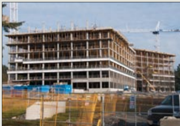
Above: the new RCMP E-Division Headquarters Below: Surrey Outpatient Care and Surgery Centre

Less visible has been the construction of the new RCMP E Division headquarters building behind the hospital in the Green Timbers property. However, the other day with the promise of spring in the February sun, we captured these photos just to bring you up to date.