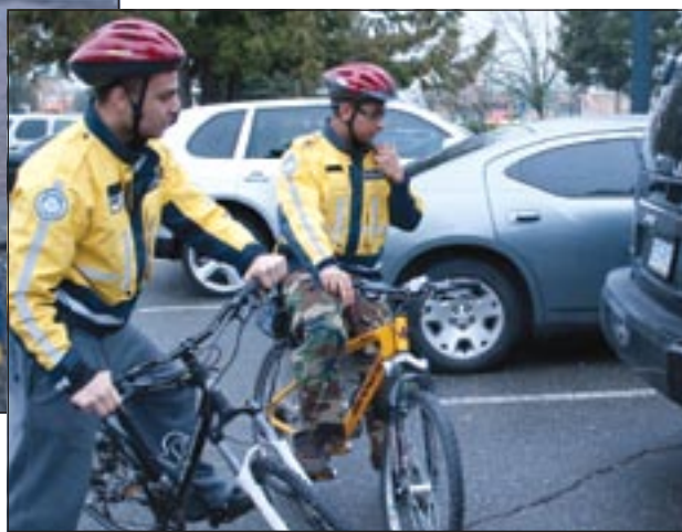
Newton Community Volunteer Patrol at the Newton Loop. At right, bike patrol checks plates for "stolens"